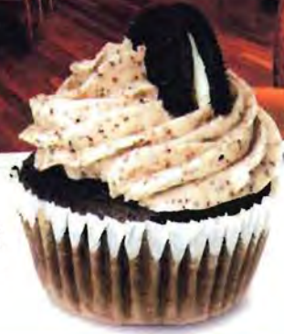
Jaleo's stunning dining room and a Sticky Fingers sweet.