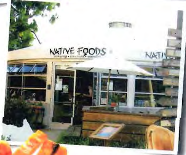
From top: LA's Dosa Truck, Native Foods' Costa Mesa location, and Veggie Grill's Sweetheart Fries.