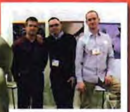
The Chicago Soydairy team and their delicious Dandies.